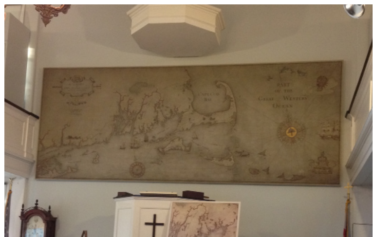
Ashley Mural on the wall over the pulpit in the Christian church building of the museum

During the restoration it became apparent that what was needed to fully appreciate Ashley's work was a view book